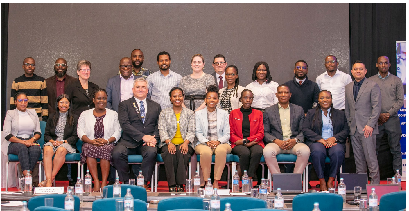
Participants at the Standards Alliance, FDA Workshop Agenda on November 6–10, 2023, in Nairobi, Kenya

More information on the MDRC project is available on the Standards Alliance Phase 2 website .