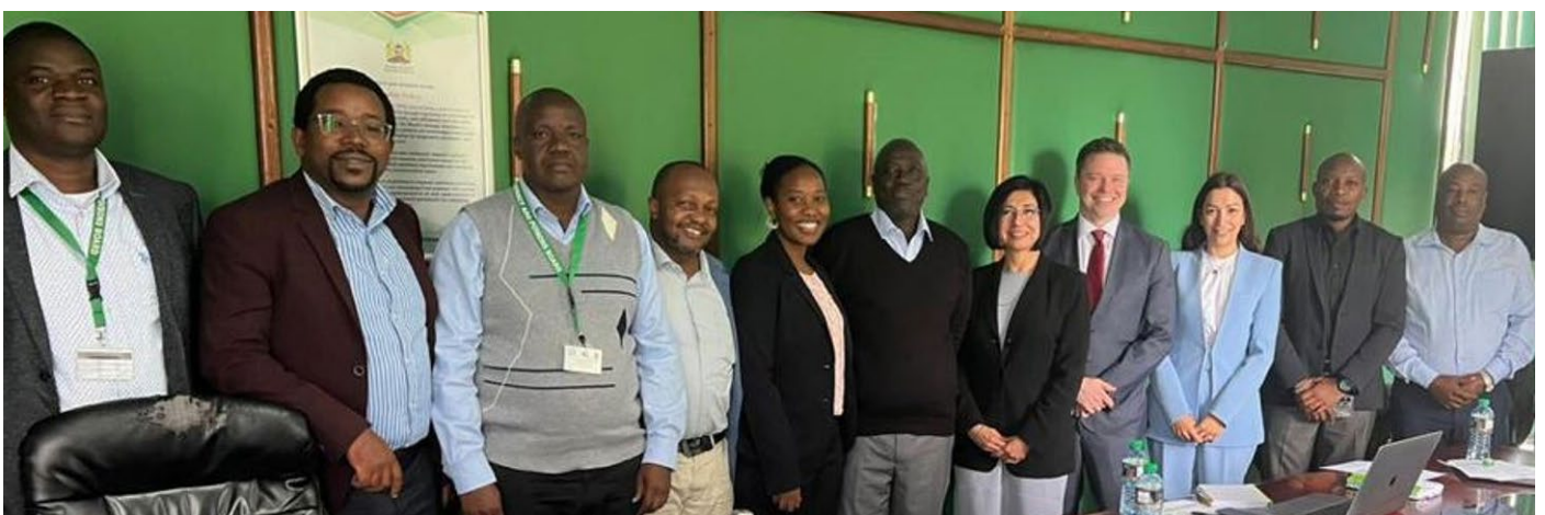
Representatives of the Kenya Pharmacy and Poisons Board (PPB) meeting with the MDRC team in Nairobi, Kenya

Complementary partnership in Africa due to this work includes collaboration between the MDRC team, the South African Health Products Regulatory Authority (SAHPRA), and the U.S. Trade and Development Agency (USTDA). USTDA began working with SAHPRA in an effort to launch an Africa-focused healthcare initiative on the sidelines of the December 2022, United States–Africa Leaders Summit, which aimed at strengthening U.S.–Africa ties and fostering new economic engagement. USTDA's initiative was intended to provide a framework for engaging